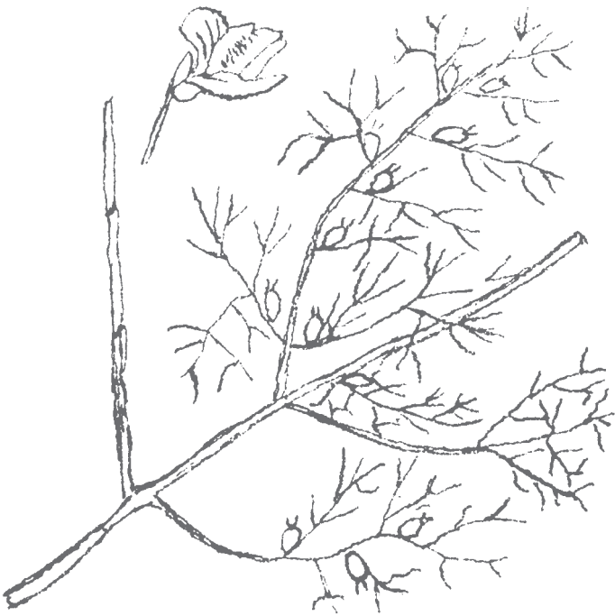
The bladderwort ( Utricularia spp.) has no roots and just floats freely in water.

Some of the more unusual plants that live in Manitoba are found in bogs. Bog plants have many extraordinary physical adaptations that allow them to survive in very nutrient-poor soil and several of these species are carnivorous. Examples of these carnivorous plants are the sundew, the pitcher plant and the bladderwort. Each plant species has a unique way to lure, catch, kill and digest prey to collect the nutrients missing from their diet. Don't worry, these plants can't hurt you; they only feed on small arthropods, like flies, moths, wasps, frogs and other tiny insects! Here's more information about bogs and the communities they support!